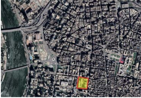
Figure 3 (left): Land of Ministry of Interior in Ministries squares in downtown Cairo. source: google earth and labeling by author