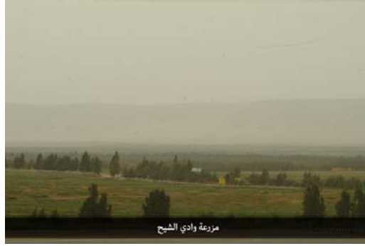
Figure 4 (right): Agricultural Farm owned by NSPO in deserted area in upper Egypt.