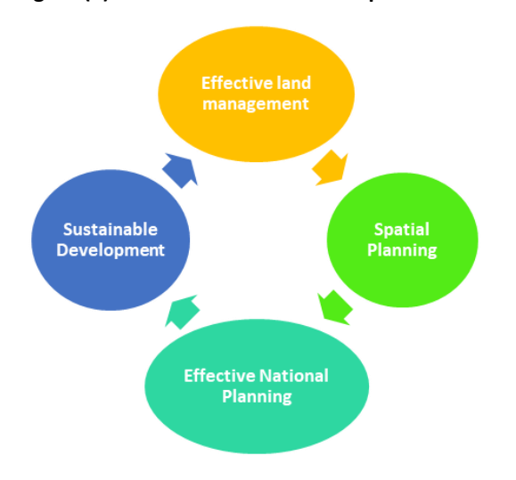
Figure (1): Land Sustainable Development Framework

The emerging concept "Urban Sustainable Development" appeared to stand for challenges facing urban planning and design. Two main issues could be considered in this regard; 1) the expected increase of the cities and its population, as according to the UN-DESA, in 2018 around 55% of the world's population live in urban areas, which is expected to increase to reach 68% by 2050 proving a gradual shift from rural to urban areas (United Nations, 2018). That led to emergence of many new concepts such as