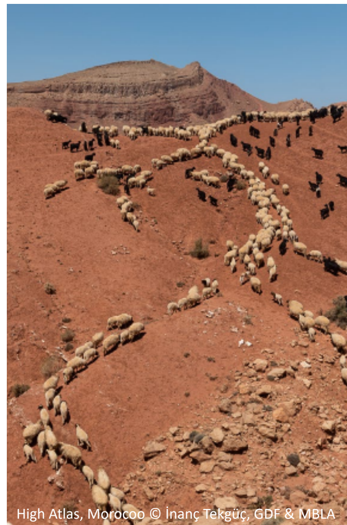
High Atlas, Morocco

المركز اللبناني للدراسات The Lebanese Center for Policy Studies