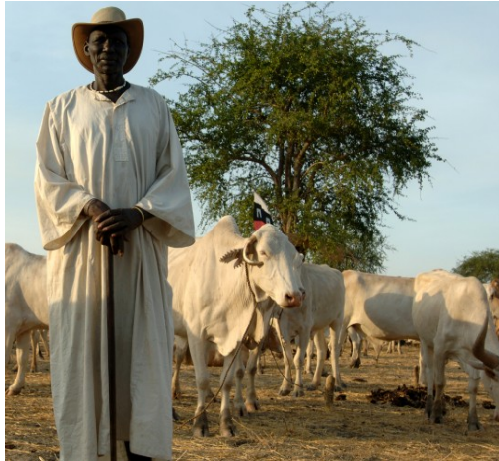
Sudan, New African Magazine 2015