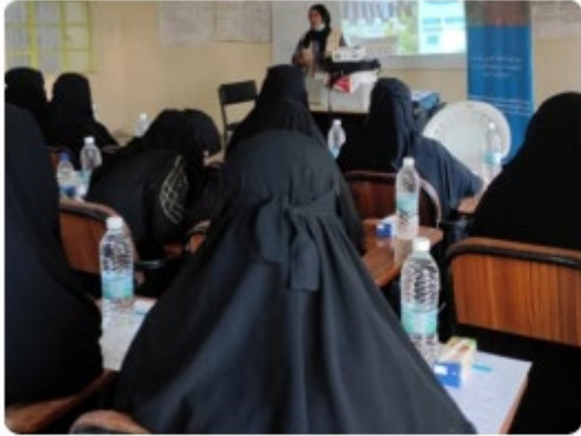
Increased and equal access to basic services