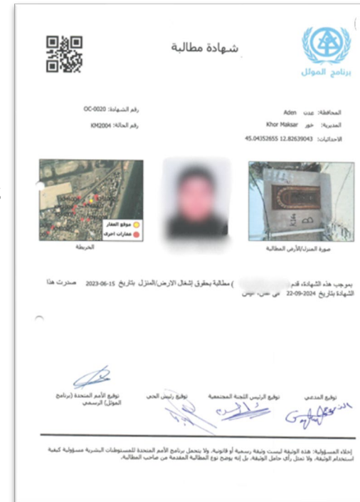
Issued Certificate for a Project Beneficiary