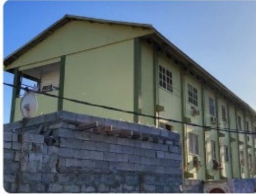
Effective settlement growth and regeneration