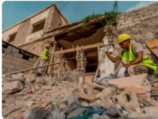
Strengthened climate action & improved urban environments