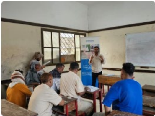
Effective shelter & housing land & property (HLP) rights