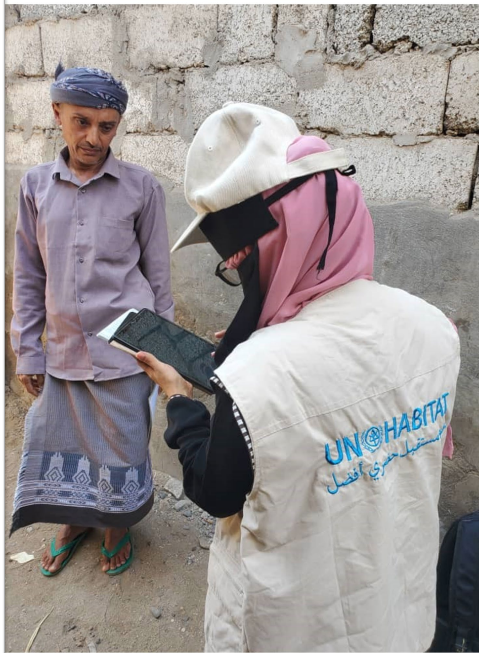
Enumerators During Data Collection