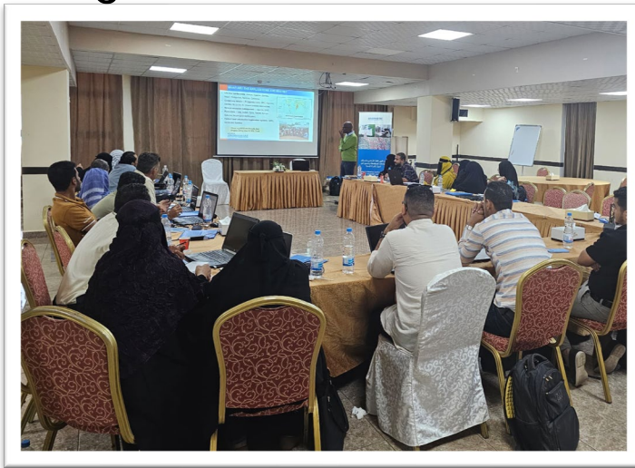
Technical STDM training