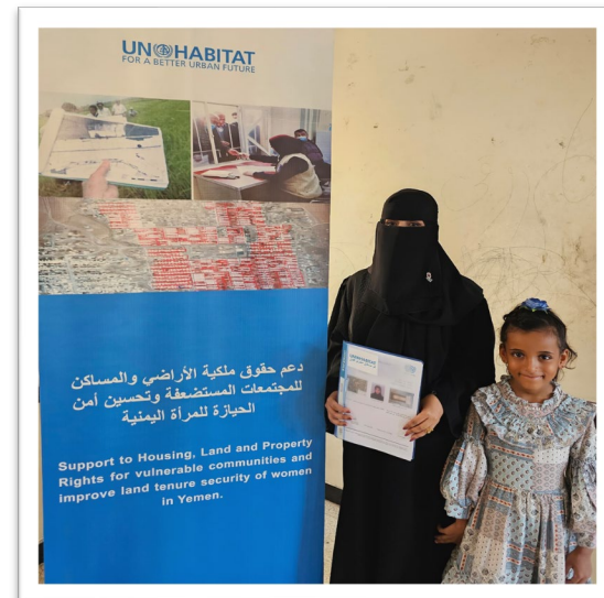
Beneficiary from Aden with her HLP Certificate