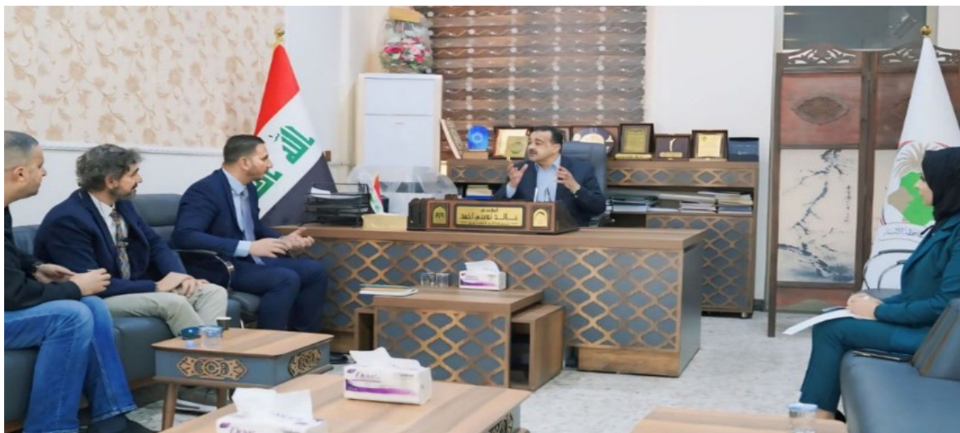
Project engagement and advocacy session with the Deputy Governor in Anbar (UN-Habitat Iraq)

PROJECT GOAL - Improve legal, institutional and operational framework regulating e-land governance and housing, land and property (HLP) rights digitization.