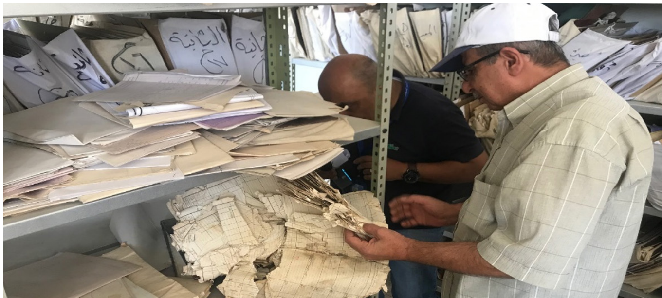
Safeguarding of tenure documents (UN-Habitat)