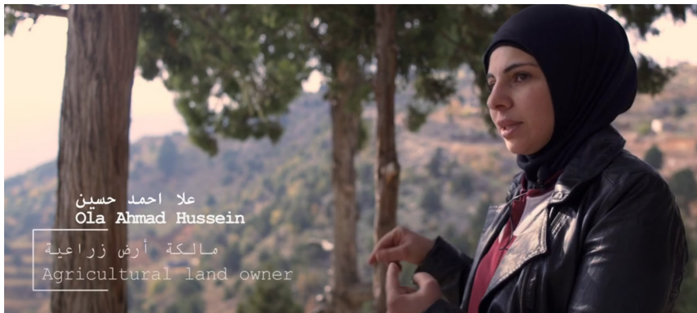
Screenshot of an advocacy video on women’s HLP in Lebanon (UN-Habitat Lebanon, 2022)

PROJECT GOAL - Strengthen land governance in Lebanon by identifying challenges and priorities while promoting inclusive solutions and raising awareness of social barriers limiting women’s access to their HLP rights.