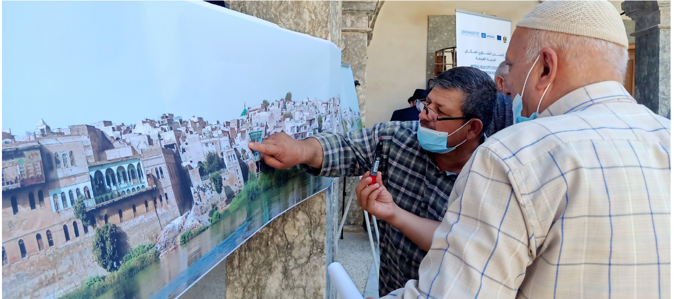
Reviving Mosul and Basra Old Cities (UNESCO, 2020)