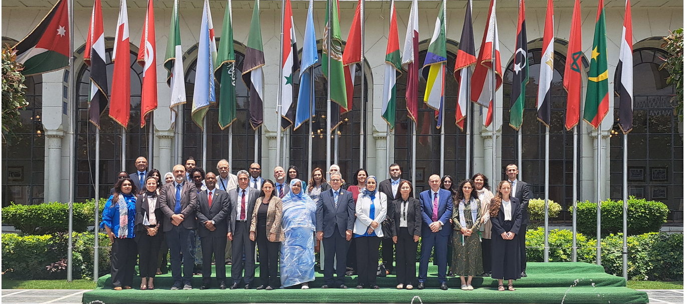
Arab Land Initiative Reference Group Meeting, Cairo, Egypt (UN-Habitat, 2024).