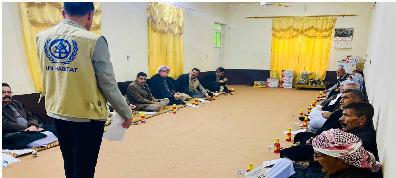
Awareness session in Tel Uzair, Sinjar (UN-Habitat Iraq)