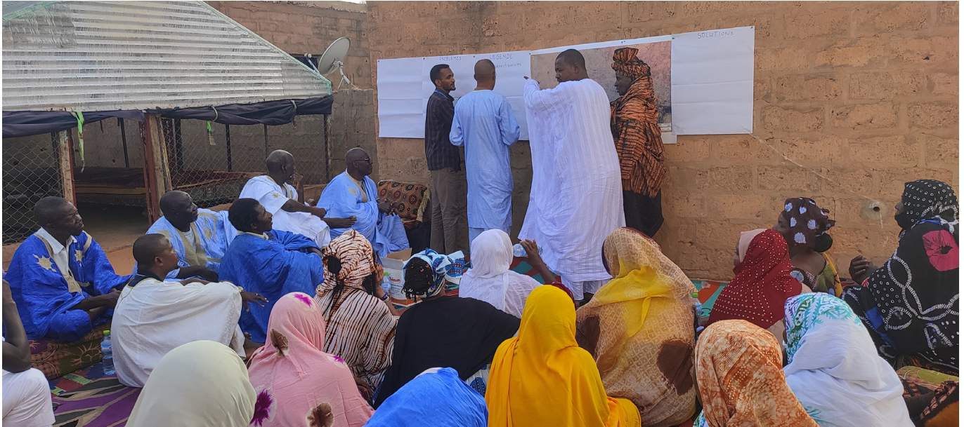
Participatory mapping in the neighborhoods of Tinzah and Inity (UN-Habitat/UNDP).

PROJECT GOAL - Better equip local leaders and communities in facing rapid urbanization to understand the risks and plan practical actions to progressively improve the urban resilience of Kaedi.