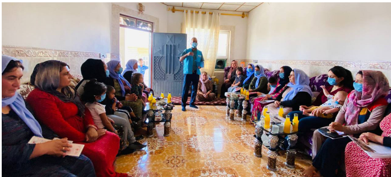
Awareness-raising session on HLP in Sinjar district (UN-Habitat Iraq, 2022)

PROJECT GOAL - Improve the rights and living conditions of the Yazidi minority population in Ba'aj and Sinjar Districts