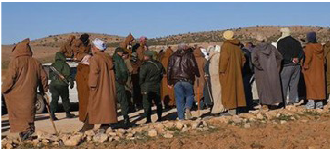
(Arab Group for the Protection of Nature)