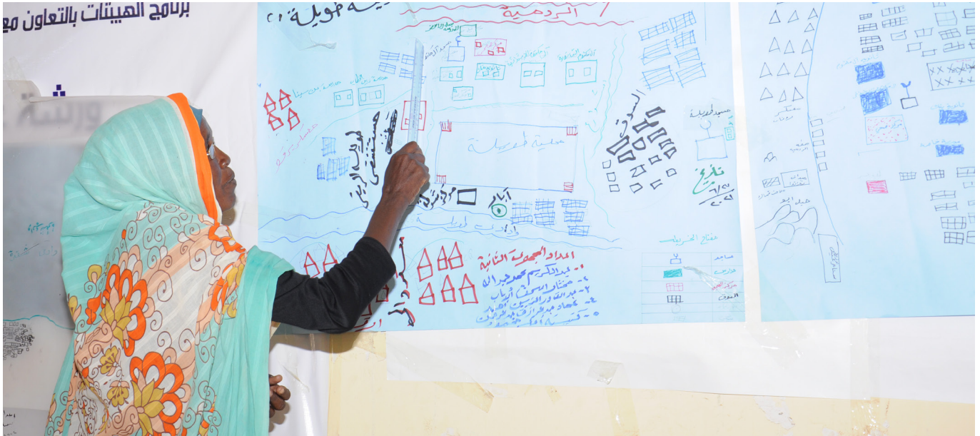
Capacity Building on sketch mapping, Darfur (UN-Habitat)