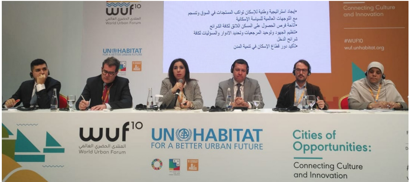
Launch of the National Housing Strategy during the World Urban Forum 10 (UN-Habitat, 2020)