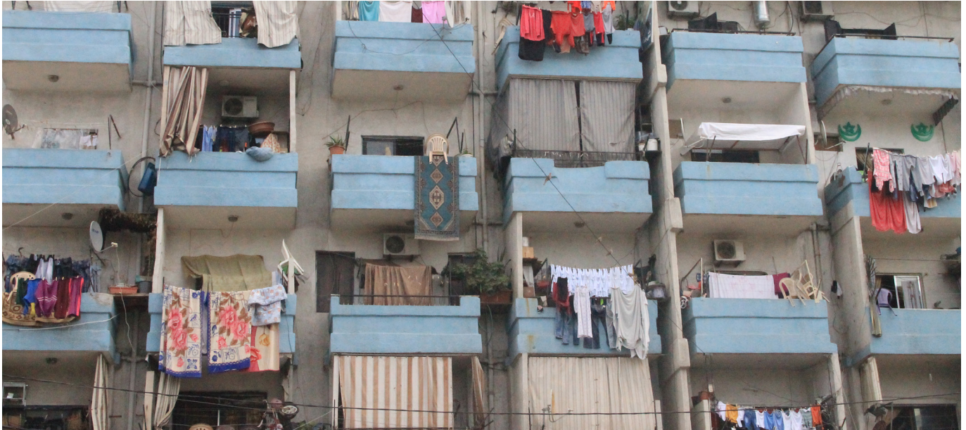
Part of the report cover (UN-Habitat and UNHCR, 2018)