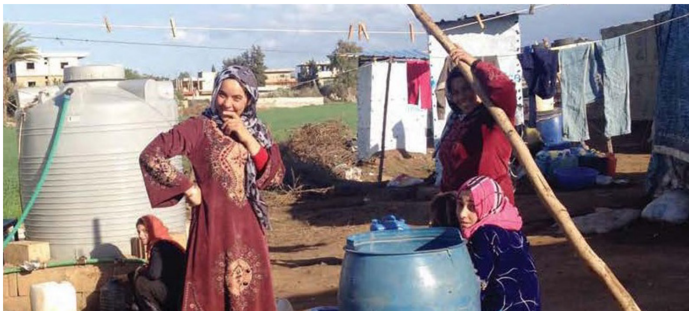
Syrian refugees in an informal tented settlement in Akkar, Lebanon (UN-Habitat and UNHCR, 2014)

PROJECT GOAL - Develop a research study to inform humanitarian and government entities in designing policies, planning decisions and programmes that ensure refugees and vulnerable Lebanese households' security of tenure and the rights to safe, affordable and adequate shelter.