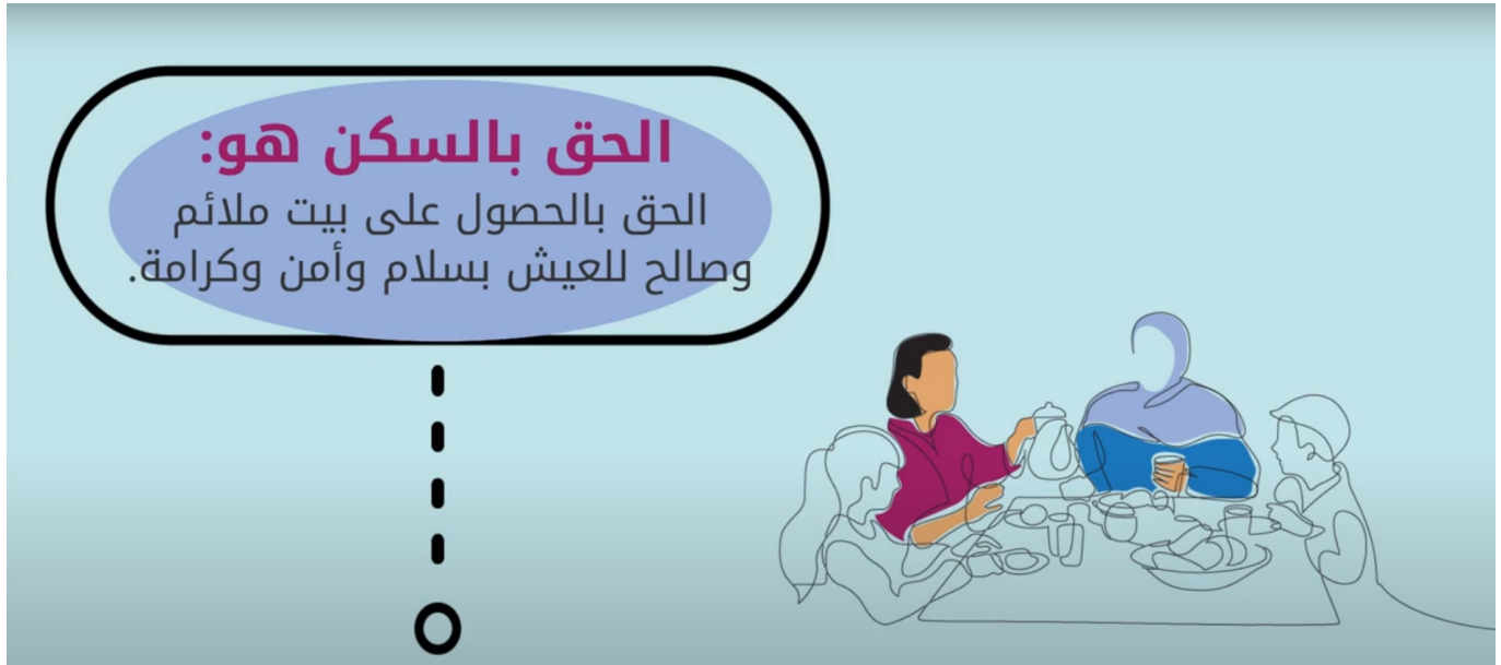
Screenshot of an advocacy video on women's HLP in Lebanon (UN-Habitat Lebanon, 2022)