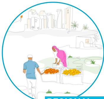
REGIONAL pag. 38 - 51