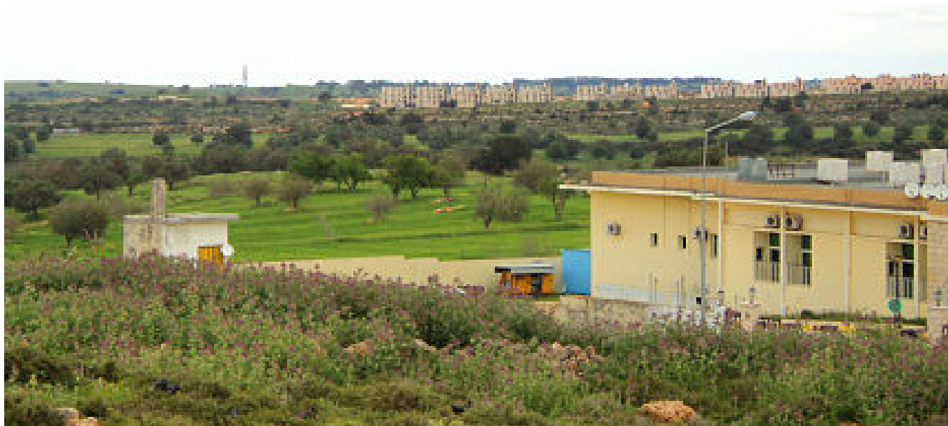
Libyan countryside

PROJECT GOAL - Assess the land and conflict nexus in Libya to provide information on the status of land tenure security and HLP rights, land use, land development, land value, and land disputes resolution in relation to their broader role in sustaining peace within the humanitarian-peace-development nexus.