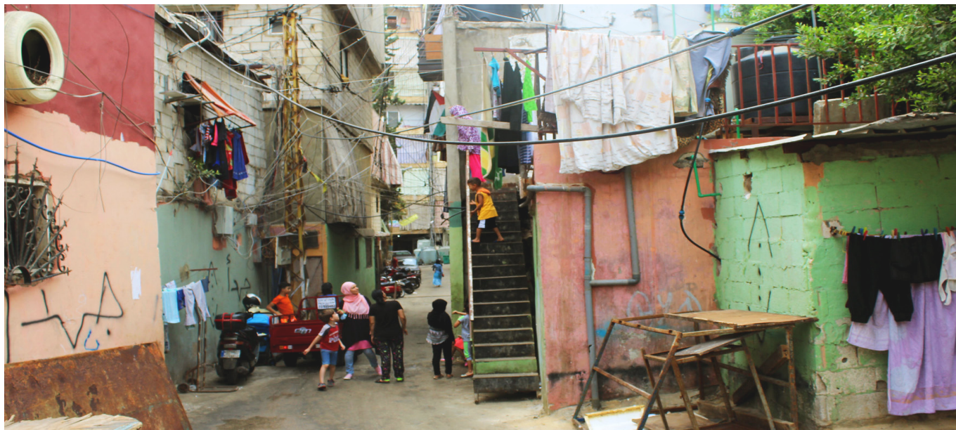
Daouk Ghawash gathering in Beirut, Lebanon (UN-Habitat, 2019)

PROJECT GOAL - Identify and analyse trends and patterns of housing, land and property issues that selected Syrian refugee communities currently residing in Lebanon face back in Syria.