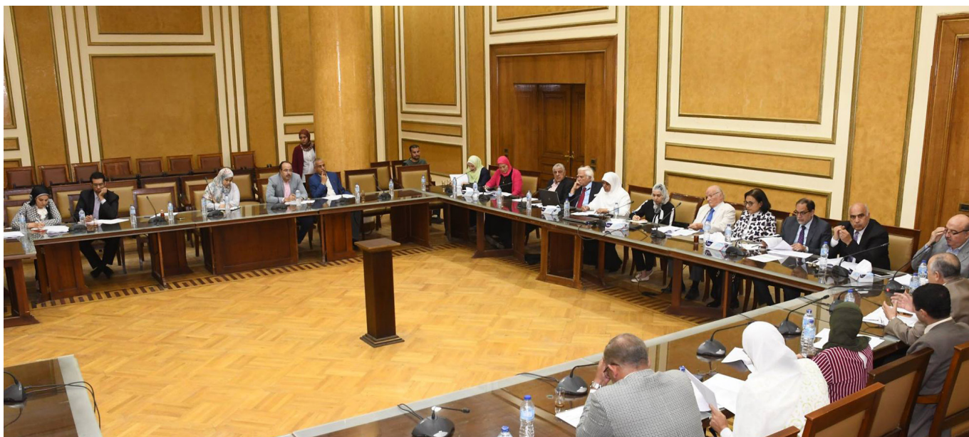
Consultation session with national housing experts during the development of the national housing strategy for Egypt (UN-Habitat, 2020)

PROJECT GOAL - Advance the right to adequate housing for all in the Arab region through supporting countries to identify policies framework and priority interventions.