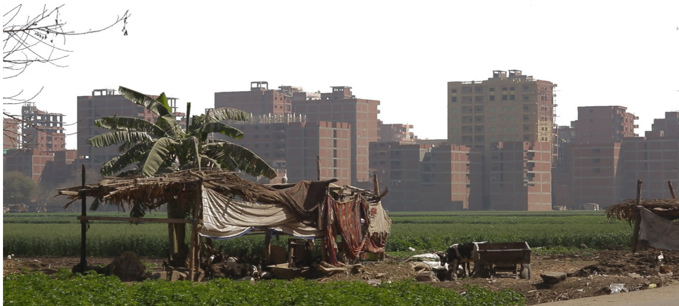
Urban Sprawl at Qalyoubia Governorate (UN-Habitat Egypt, 2017)

PROJECT GOAL - Enhance governance and management of urban expansion in the Greater Cairo region through piloting land readjustment methodology.