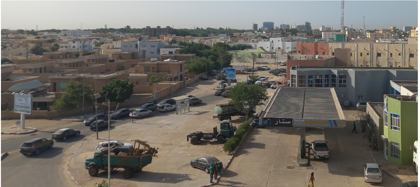
View of Nouakchott, Mauritania (UN-Habitat)