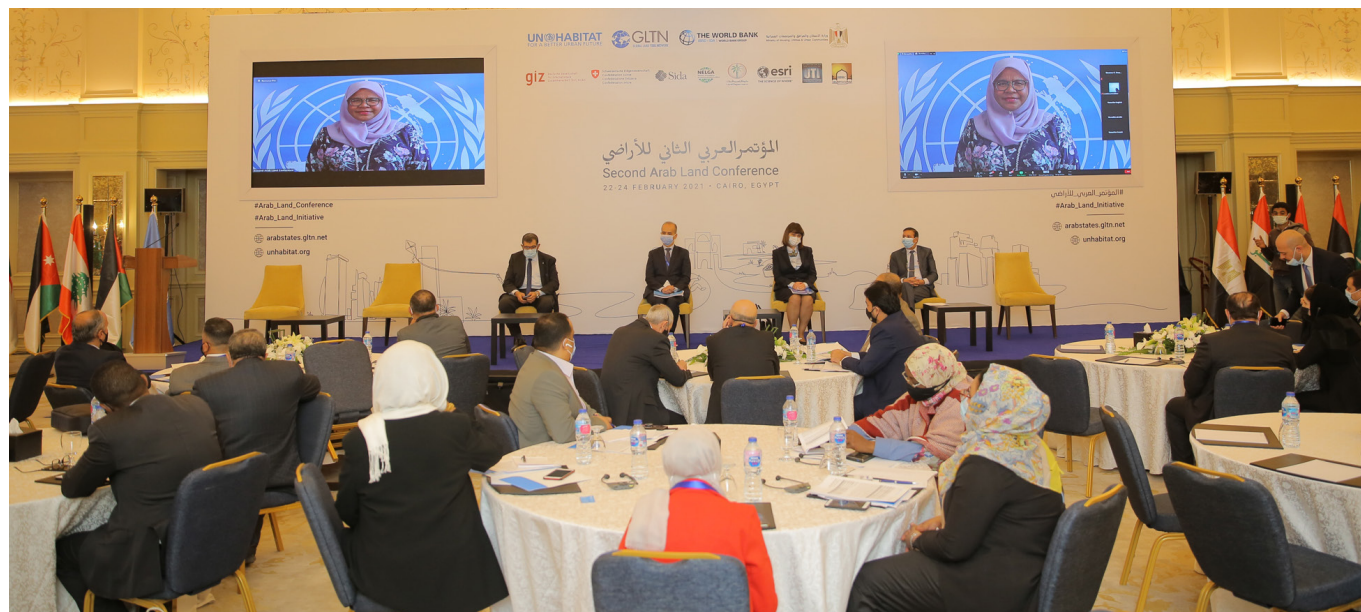
Second Arab Land Conference, Cairo, Egypt (UN-Habitat, 2021)

PROJECT GOAL - Improve the capacity of regional and national stakeholders to manage and administer urban, peri-urban and rural land in the Arab states to achieve inclusive socioeconomic development - particularly for women, youth and displaced - peace and stability.