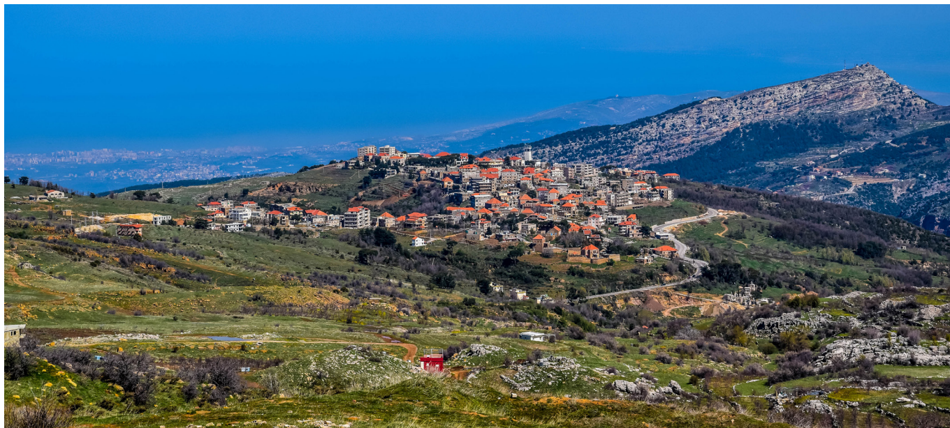
Hadath El Jebbe, Lebanon