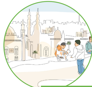
EGYPT pag. 6 - 9