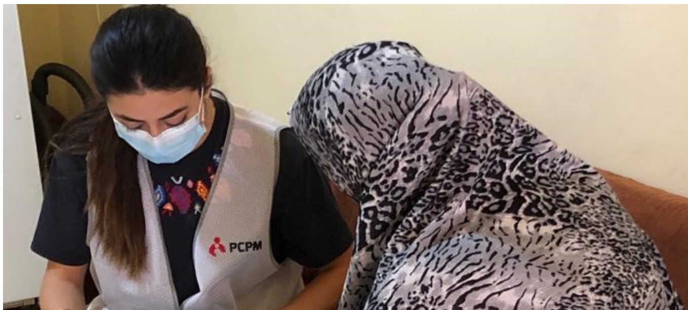
A household visit to assess the vulnerability of the identified family (UN-Habitat Lebanon, 2020)

PROJECT GOAL - Enhancing the life-saving of most vulnerable families affected by the August 2020 Beirut Port explosion, ensuring adequate housing and temporary shelter options.