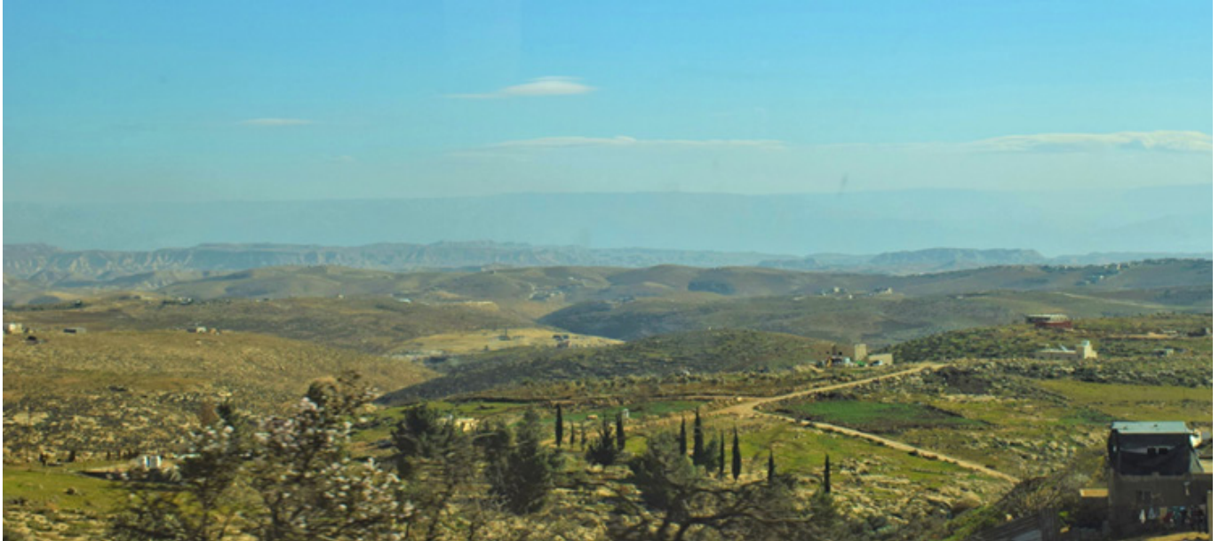
Hebron, Palestine (UN-Habitat Palestine, 2021)

PROJECT GOAL - Promote inclusive and sustainable economic development within a better functioning Palestinian democracy by improving socioeconomic conditions of Palestinian communities in Area C of the West Bank.