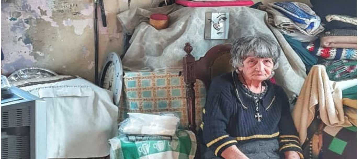
Armenian elderly woman in her damaged house in Naba'a, Lebanon