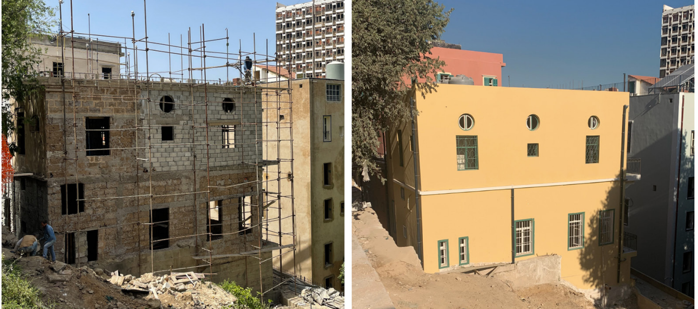
A sandstone facade of heritage value, before and after undergoing its rehabilitation under the Rmeil Cluster project (n.d.)