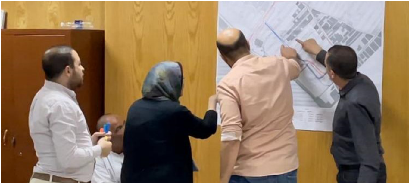
Participatory Urban Planning sessions with Almana landowners in Qena