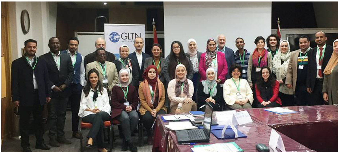
Induction workshop, Cairo, Egypt (UTI, 2020)

PROJECT GOAL - Assess the land sector capacities in the region, identify the learning offers and define a capacity development strategy and a set of priority capacity development initiatives to be led by leading experts and institutions from the region.