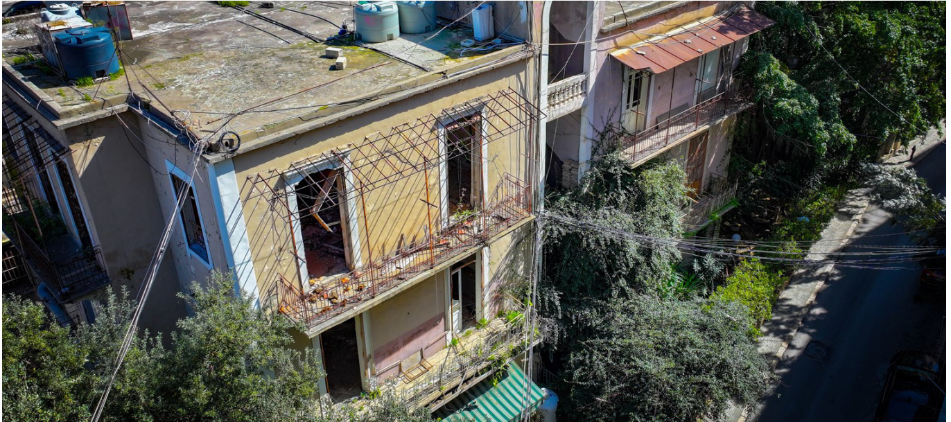
A building of heritage value from the 1930s in Rmeil before its rehabilitation under the BERYT project

PROJECT GOAL - Support the rehabilitation of prioritized historical housing for the most vulnerable people and provide emergency support to creative practitioners and entities in the cultural sector in areas affected by the Port of Beirut explosion.