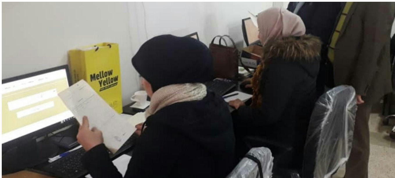
Developing data management system for scanning and archiving tenure documents (UN-Habitat Syria)