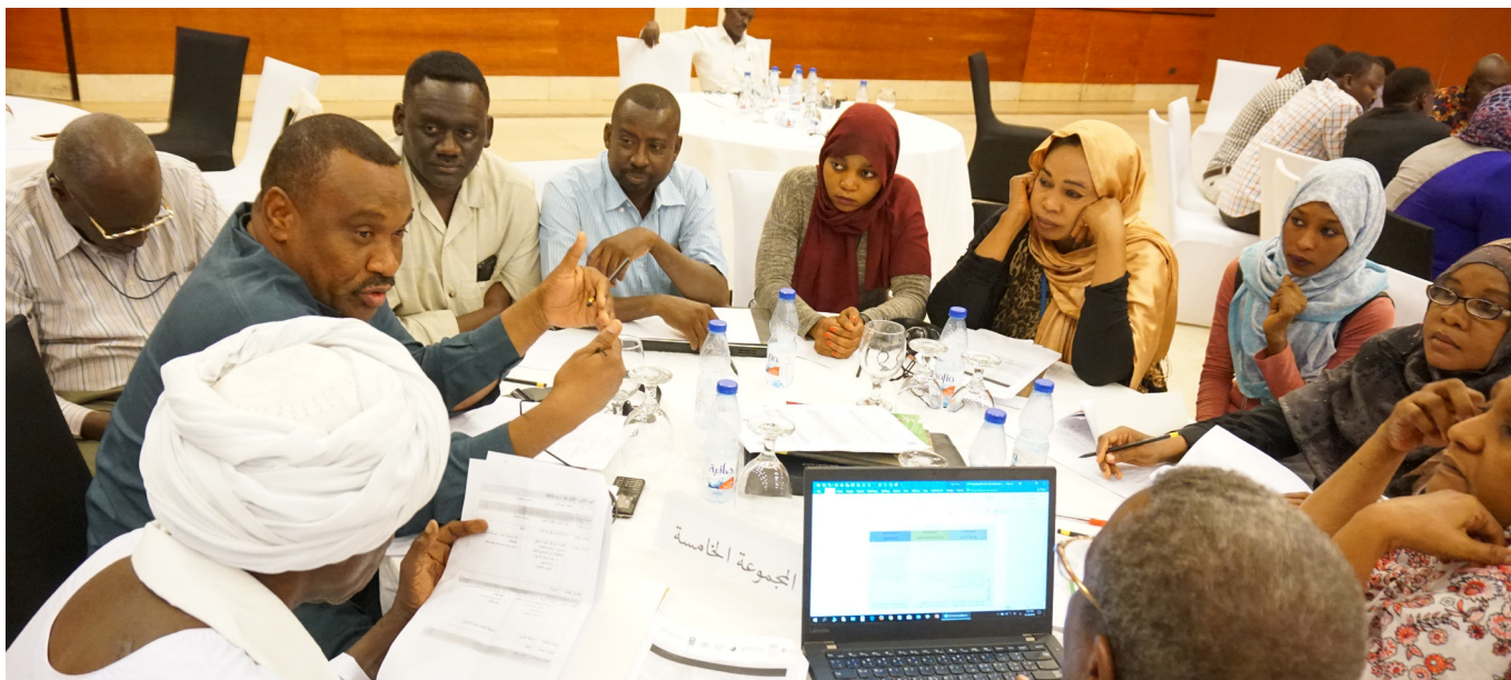
Group discussion on land issues (UN-Habitat Sudan)

PROJECT GOAL - Facilitate knowledge sharing to establish a common understanding of the role of civil society in land governance across the Arab region, with a particular focus on land and property rights and tenure security.