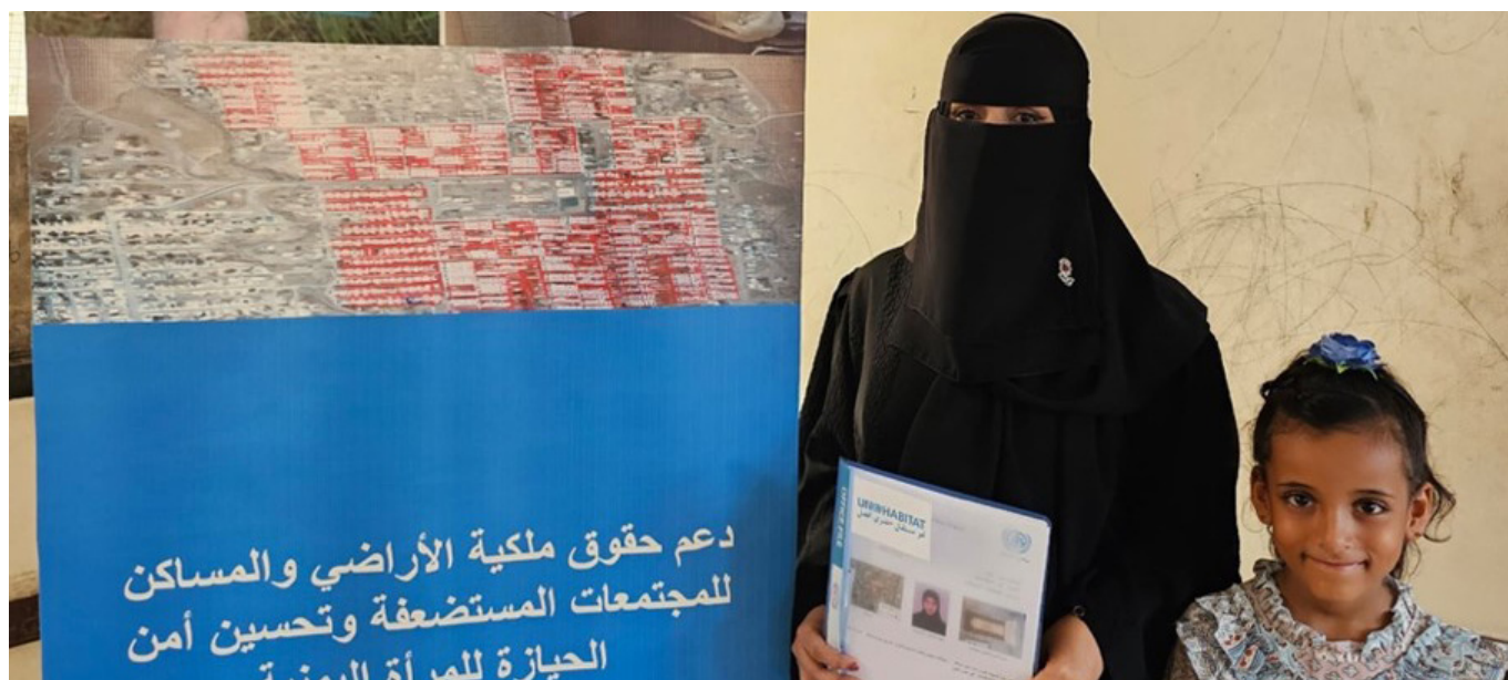
HLP Certificate Distribution, Aden (Marwa Nasher, UN-Habitat Yemen, 2024)

PROJECT GOAL - Accelerate urban recovery and peacebuilding by documenting HLP rights violations and challenges and improving access to HLP rights of vulnerable community members, particularly women.