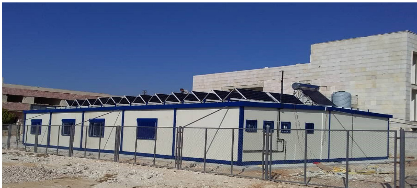
Prefabricated cadastral service center established in Qusayr city (UN-Habitat Syria)

PROJECT GOAL - Restore HLP services in Al-Qusayr, Homs Governorate - a district that experienced mass displacement during the crisis.