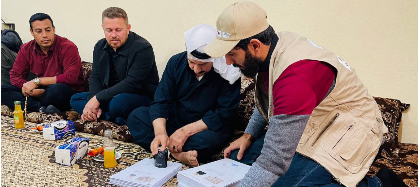
Delivery of occupancy certificates (UN-Habitat Iraq)