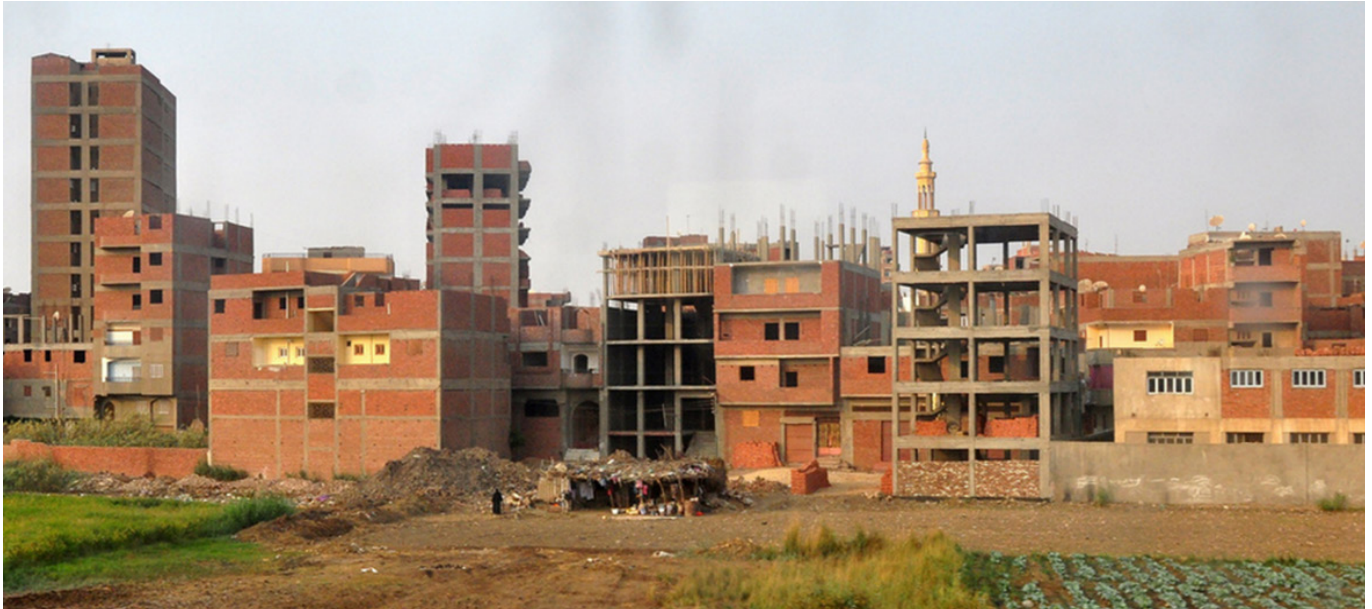
Urban Sprawl at Qalyoubia Governorate (UN-Habitat Egypt)

PROJECT GOAL - Introduce innovative concepts and tools in order to explore processes and methodologies for enhanced and more sustainable urban practices.