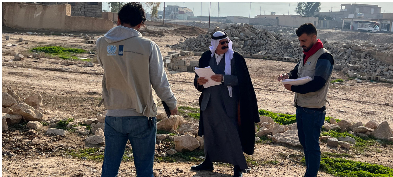
Collecting HLP Claims in Sinjar (UN-Habitat Iraq, 2023)