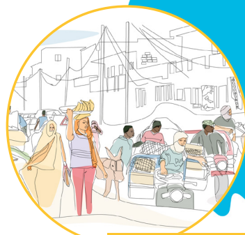
MAURITANIA pag. 28 - 29