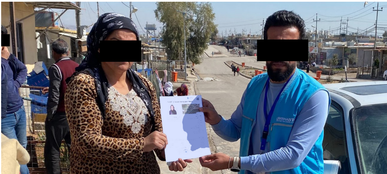
Delivery of certificates in Domiz Camp, Dohuk, Iraq