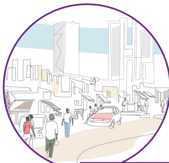
LIBYA pag. 26 - 27