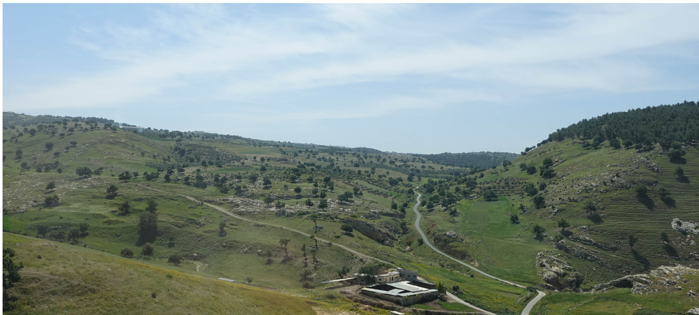
Jordan countryside