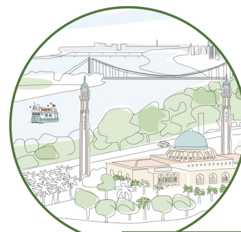
SUDAN pag. 32 - 33