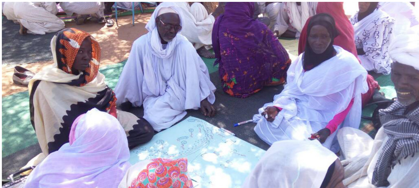
Sketch mapping in Koma Garadaya, Sudan (UN-Habitat Sudan)

PROJECT GOAL - Enhance the capacity of land institutions, including traditional administrative bodies, to improve land management in Darfur by developing effective mechanisms for resolving land rights disputes and providing recommendations to competent authorities on essential reforms, policies, and legislation.