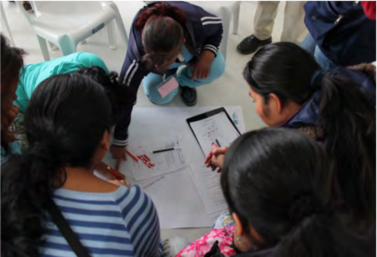
Gender equality starts from inclusive participation and project implementation by women themselves. Ciudadela Sucre settlement, Colombia.