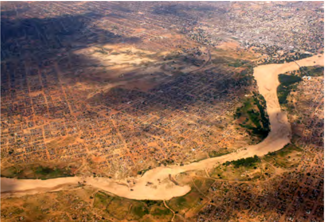
An aerial view over Nyala, the capital of South Darfur, Sudan.

regulations by the state or municipality. This is slightly counter-balanced by the call for increased community participation. Sometimes the speed of urban growth and the numbers of people and the size of land affected are used as argument against land-use planning. However, modern technologies providing up-to date geo-data within almost no time could easily deal with these developments. Regulating land uses does not mean to re-introduce old-fashioned master planning. But regulating land use is crucial to achieve sustainable land use, which in turn is a prerequisite for sustainable and resilient development.