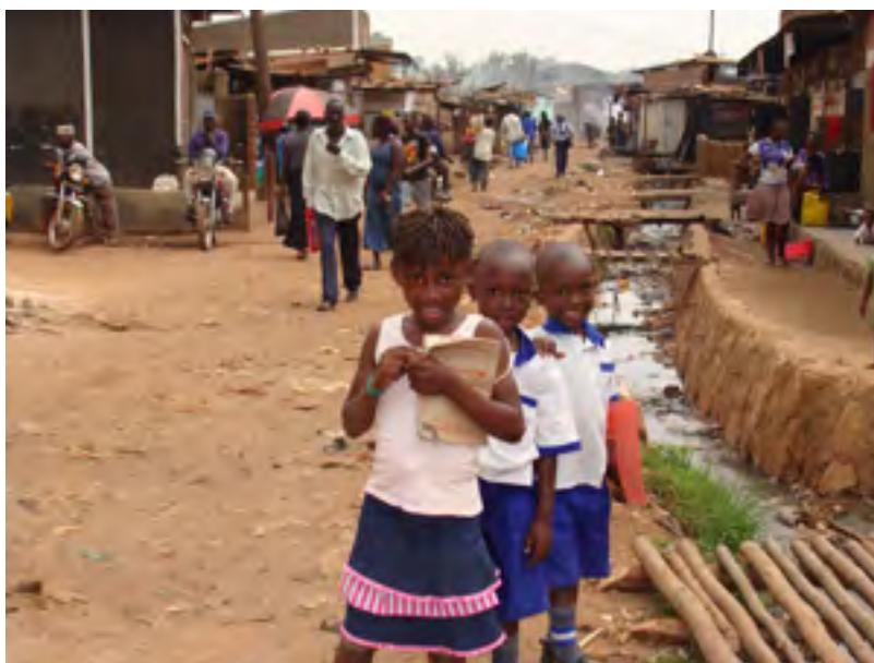
Kids going to school in an informal settlement in Kampala, Uganda.

The recent international frameworks provide vast opportunities to get involved in improving land governance. However, some topics such as the state's duty to regulate land use, the need to address lack of transparency in land administration and urban land grabbing, deserve to be adequately included in the international framework. In addition, frameworks on climate change mitigation and adaptation and those on biodiversity need to explicitly address the need to provide tenure security for the poor, women and vulnerable groups and the role of land-use planning / spatial planning in the achievement of their objectives. Even more important would be to strive for legally binding regulations on land governance.