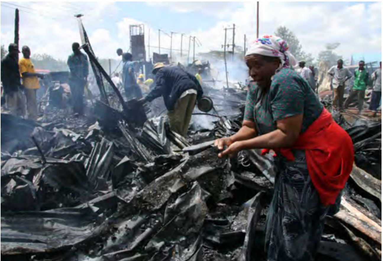
Everyone has the right to adequate housing. Mathare settlement, Nairobi, Kenya.

“National and transnational companies involved in land deals, investments and extractive and other activities involving the acquisition, use or alteration of lands bear a responsibility not to infringe on the rights of other users and owners through their activities, and to address any adverse impact arising as a result of their actions” ( United Nations Economic and Social Council 2014, paragraph 54 ).