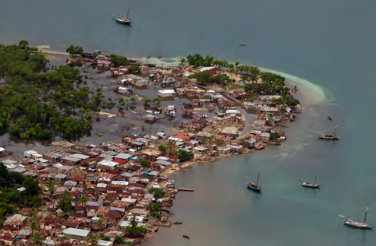
Hurricane Sandy causes heavy rains and floods in Haiti.