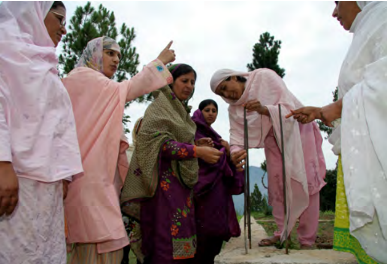
Technical team composed of women inspecting a shelter community project in Pakistan. Photo © UN-Habitat.

The role of land (governance): Land is a production factor. It is needed for a wide range of economic activities. It allows for income generation. Land can