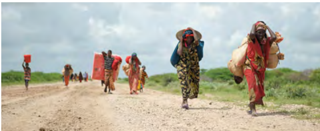
Poor, women and vulnerable groups are disproportionately affected by the continuing conflict in Somalia.

There is clear reference to many human rights instruments, including the Universal Declaration of Human Rights, the International Covenant on Economic, Social and Cultural Rights and the International Covenant on Civil and Political Rights.