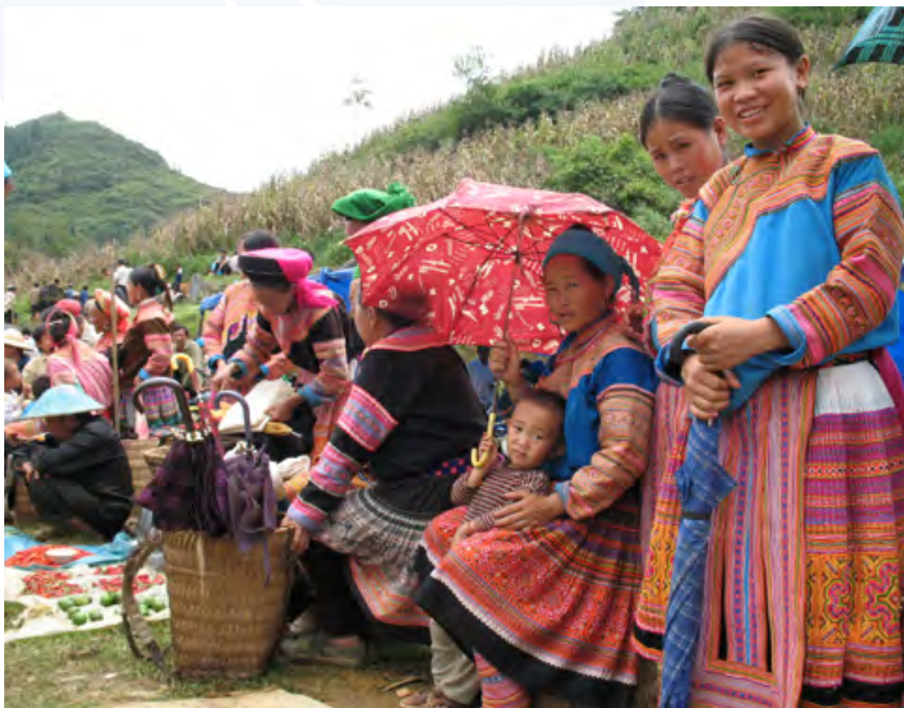
Women and girls selling their agricultural produce in Vietnam.