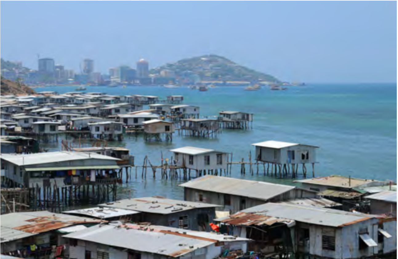
Coastal areas are highly vulnerable to climate change. Port Moresby, Papua New Guinea.