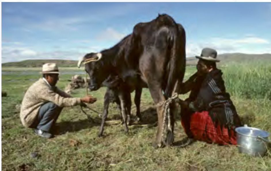
Andean locals milk a cow in Baja, Altiplano, Bolivia.

Principles on Housing and Property Restitution for Refugees and Displaced Persons by Special Rapporteur Paulo Sergio Pinheiro (Pinheiro Principles), UN Economic and Social Council, 2005