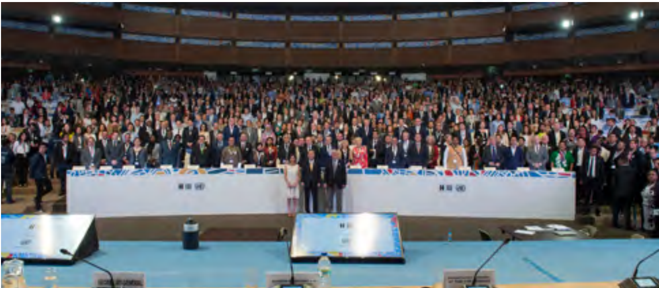
Opening of the Second World Assembly of Local and Regional Governments during the Habitat III Conference in Quito, Ecuador.