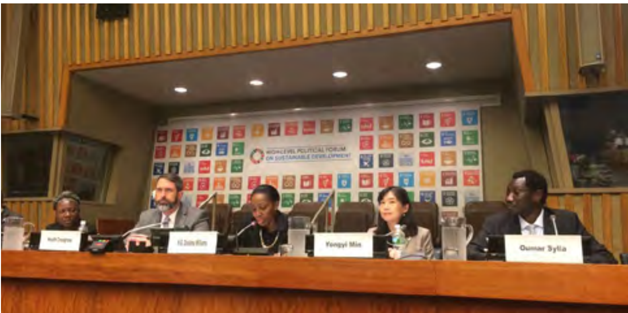
High Level Panel on 'Land Tenure Security Monitoring in the SDGs, Leaving No One Behind' in New York.

Only the SDG provide indicators. Indicators exist on the two main objectives: tenure security and sustainable land use.