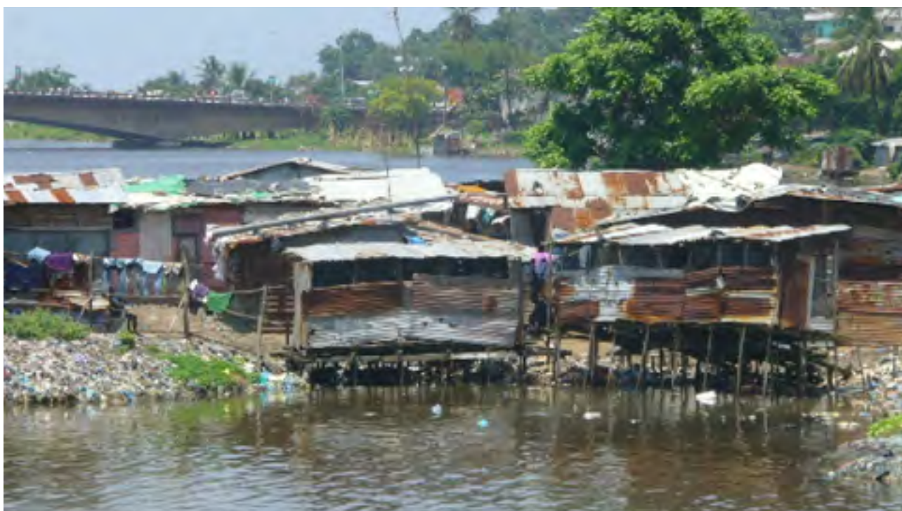
Addressing land issues significantly contributes to poverty reduction and sustainable development. Liberia.

Finally, the current development agenda provides vast opportunities to get involved in improving land governance. However, some topics, such as the state's duty to regulate land use and the need to address transparency in land administration and urban land grabbing, deserve to be adequately included in the international framework. In addition, frameworks on climate-change mitigation and adaptation and those on biodiversity need to explicitly address the role of land-use planning / spatial planning in the achievement of their objectives. Even more important would be to strive for legally binding regulations on land governance. May some of the arguments provided in this study help with lobbying on this issue.